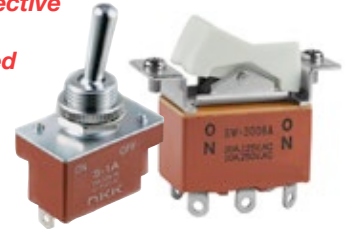
Changes for S Series Toggles & SW Series Rockers, Among Others

Revision 1: Page 1 of the revised Contact is to notify that Change Nos. 2 and 10 will be implemented at this time, and the new Effective Date is April 2025. The balance of the changes, Nos. 1, 3 ~ 9, are postponed and will be announced in the future with a new Effective Date.